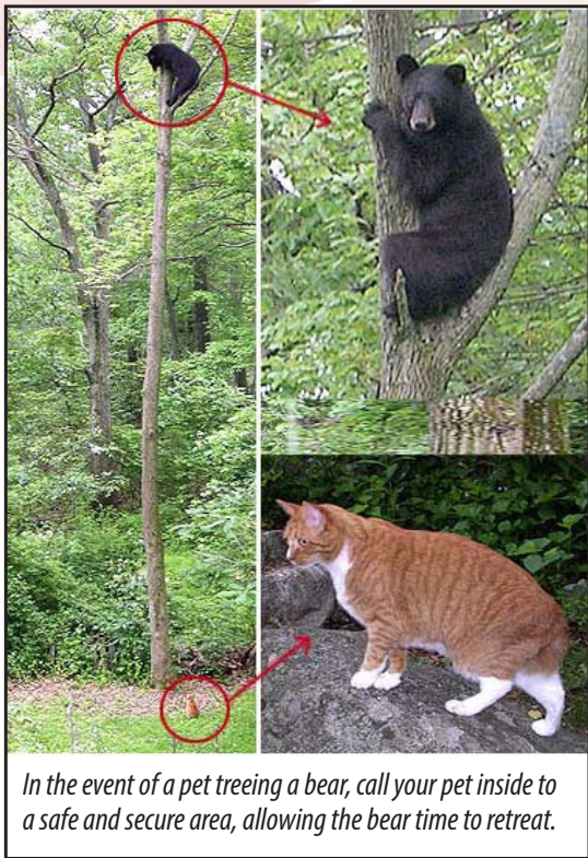
In the event of a pet treeing a bear, call your pet inside to a safe and secure area, allowing the bear time to retreat.