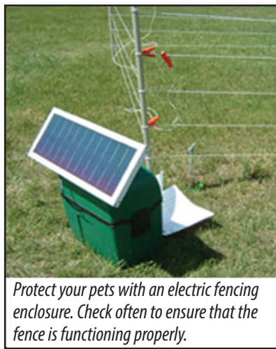
Protect your pets with an electric fencing enclosure. Check often to ensure that the fence is functioning properly.

For More Resources on Electric Fencing: http://MyFWC.com/Media/1333878/ElectricFence.pdf