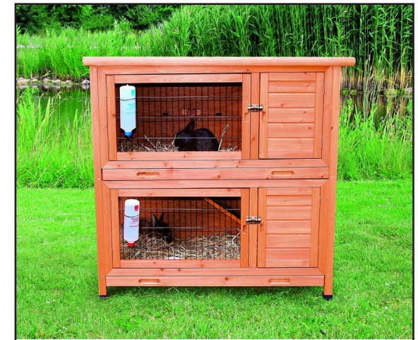
Sturdy wooden hutches are the most reliable form of protection for outdoor small animal enclosures such as rabbits and guinea pigs. Securely attach a side of the cage to a permanent structure to prevent the hutch from falling over. Secure doors with locks, keep top covered and secured. In bear country, add an electric fence for further protection.

For More Resources on Electric Fencing: http://MyFWC.com/Media/1333878/ElectricFence.pdf